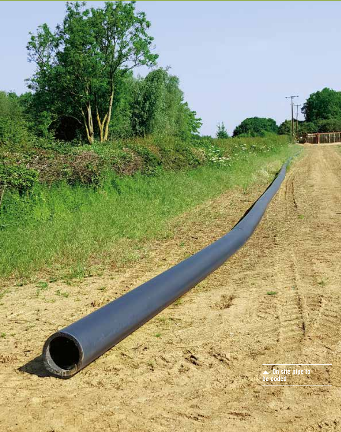
▲ On site pipe to be coded